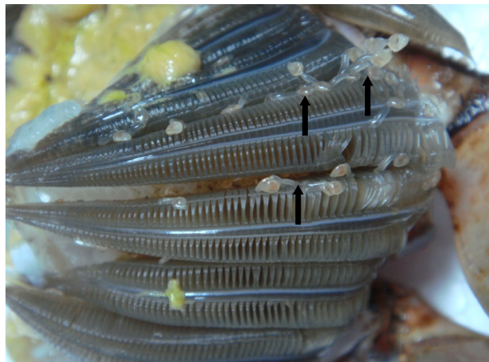
Figure 2 Gills infested with pedunculate barnacles (arrows).