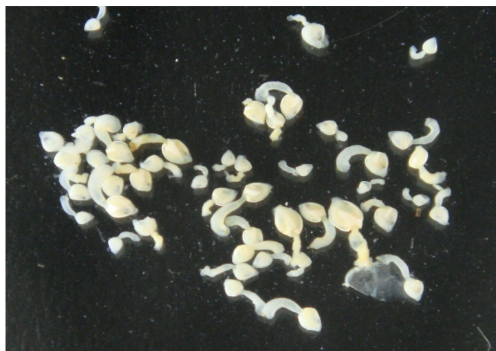
Figure 3 Pedunculate barnacles dislodged from gills.