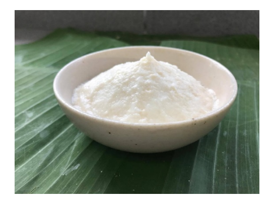
Figure 1 Sweet sticky rice puree diet.

Moreover, XG solutions at low concentration showed a high viscosity when compared with other polysaccharide solutions. Thus, XG was an effective thickener and stabilizer to modify texture of SRD [13].